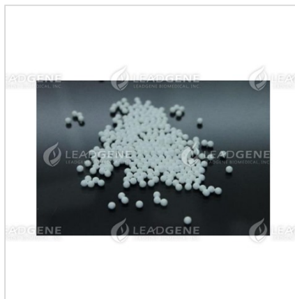
Lyophilized LEADSPHERE® One-Step RT-PCR Master Mix