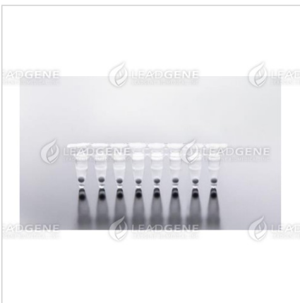
Lyophilized LEADSPHERE® One-Step RT-PCR Master Mix