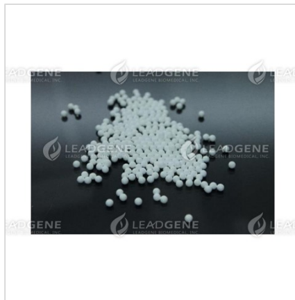
Lyophilized LEADSPHERE® Proteinase K