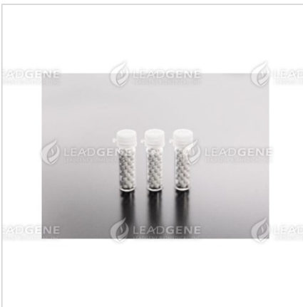
Lyophilized LEADSPHERE® Proteinase K