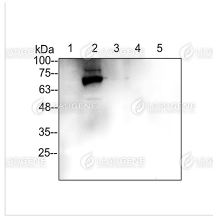
Western blotting analysis of DENV NS3 antibody (1:1000)